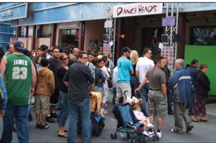
Universal Studios, Hollywood, CA