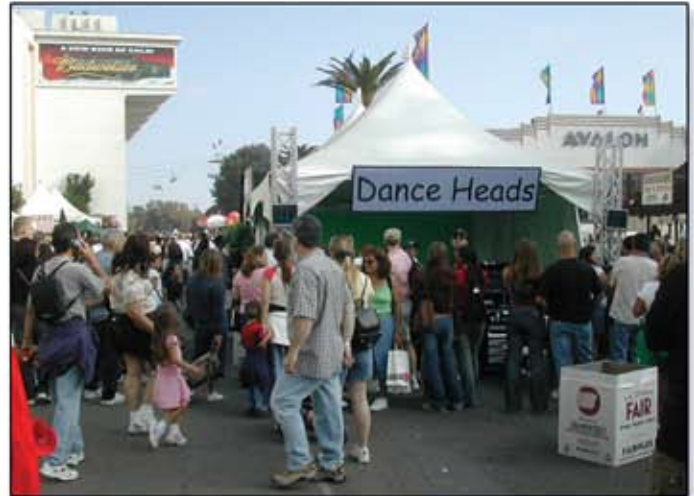
L.A. County Fair, CA