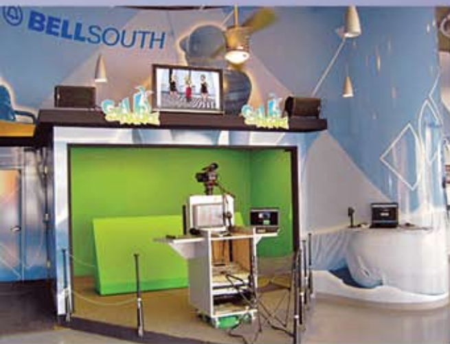
Turner Field, Atlanta, GA

Dance Heads® , using its patent pending technology based interactive entertainment, focuses on the guest experience while at the same time creating a viral corporate branding tool.